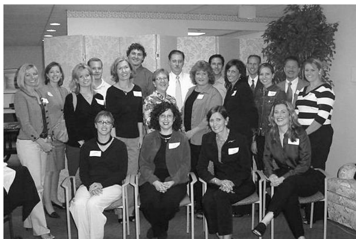
Members of the Class of 2006 at orientation.

The class doesn’t meet again for a full session until January and then serious project discussions will be underway.